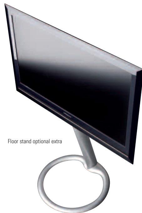
Floor stand optional extra